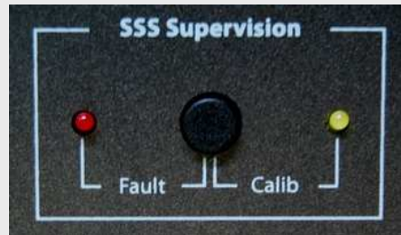
User interface on the front panel of the UT26 processor

Option SSS for processeur UT26 and StepArray column loudspeakers.